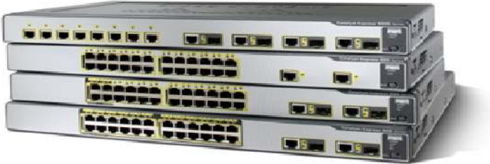
Figure 1. Cisco Catalyst Express 500 Series Switches

Figure 2 shows typical Cisco Catalyst Express 500 Series Switch deployment scenarios.