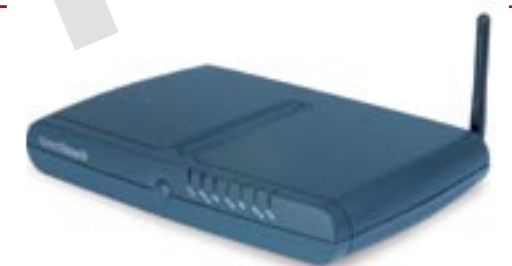
SpeedTouch 706WL - 780WL