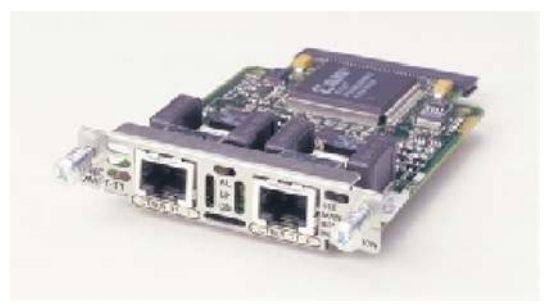
Figure 1. Cisco Dual Port T1/E1 Multiflex Voice/WAN Interface Card

VWIC-1MFT-T1, VWIC-2MFT-T1, VWIC-2MFT-T1-D1, VWIC-1MFT-E1, VWIC-2MFT-E1, VWIC-2MFT-E1-DI, VWIC-1MFT-G703, VWIC-2MFT-G703